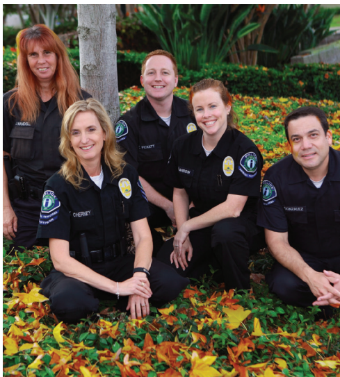
The City of Irvine, California, Animal Services Division

This Award is given to a current Agency Member of NACA for effective training programs for personnel, outstanding/innovative public education programs, active community involvement, and average officer response time to calls for assistance.